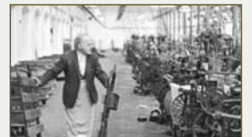
Weaving at Bancroft Mill