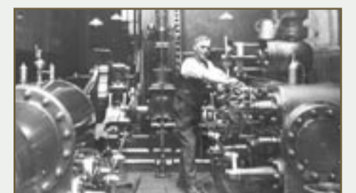
Clough Mill Engine

A very powerful engine. When fuel is burned inside the engine, hot air and gases are produced and then pushed out of the back of the engine at high speed which forces the engine forward.