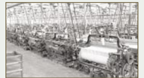
Weaving at Bancroft Mill