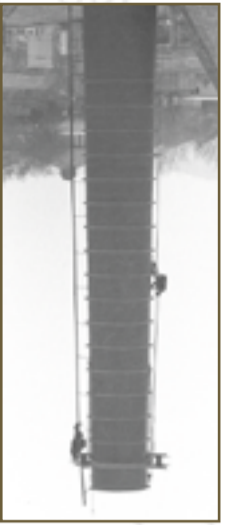
Calf Hall Chimney

Towards the end of the eighteenth century, handloom weaving was the main industry in Barnoldswick. At this time there were very few mills and work was carried out mostly by individuals in their homes. This situation began to change in the early nineteenth century. The first mills came into existence when technological advances allowed water powered machines to carry out the spinning, which meant work was not necessarily carried out at home any longer. The nature of the landscape in